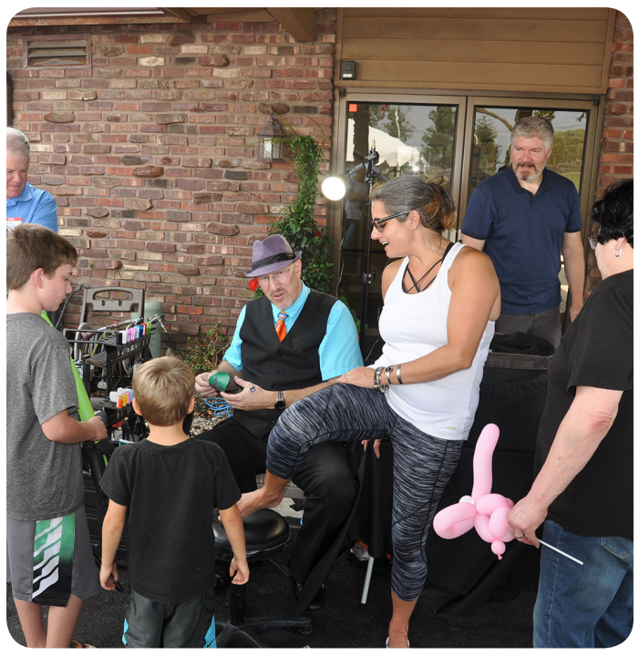
Summer sunshine, balloons, and fun for all!