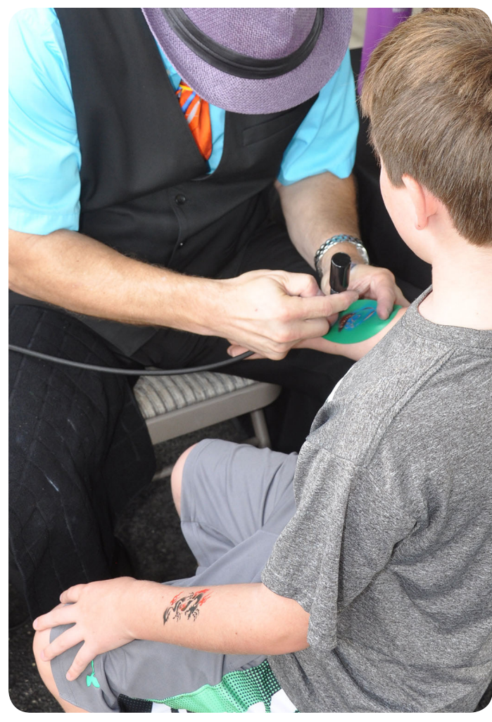
Temporary "tattoos" provided many smiles at the Village Picnic

The Illinois Tollway Authority (ITA) anticipates that the Bradley Road bridge will reopen in Spring 2019. This event will arrive later than originally forecasted due to some difficulty in procuring materials. On the bright side, the new spring schedule should allow the landscaping plantings to take root more successfully.